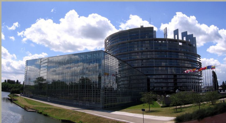
The EU Headquarters

Revived Roman Empire (EU), 10 kingdoms (WEU?)