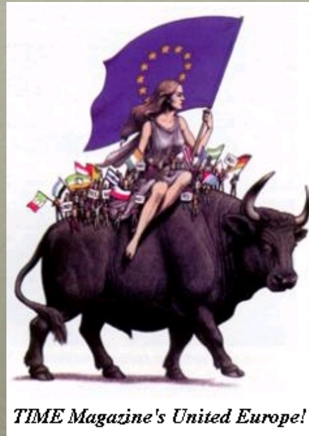
TIME Magazine's United Europe!