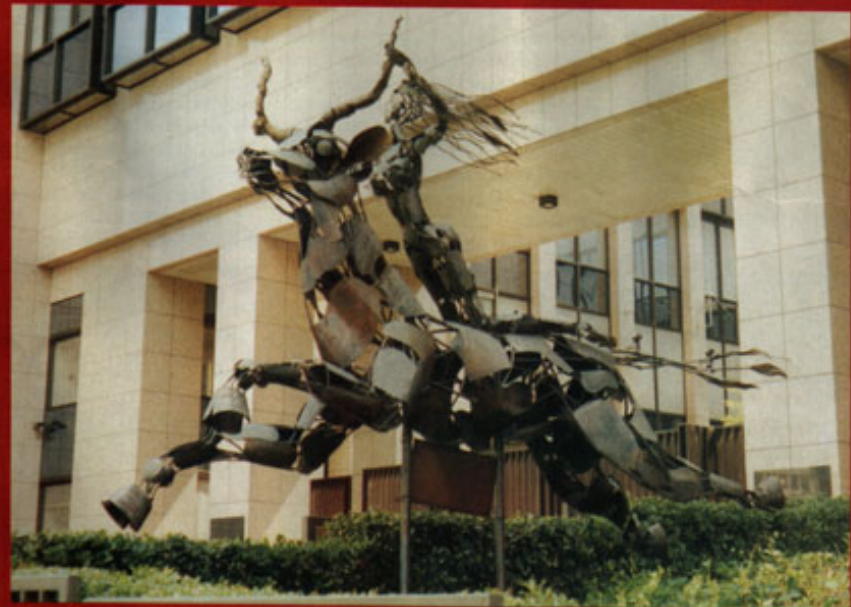
Sculpture 2000 - Outside the European Council Building in Brussels!