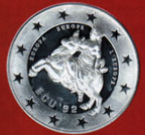
1992 German Ecu coin!