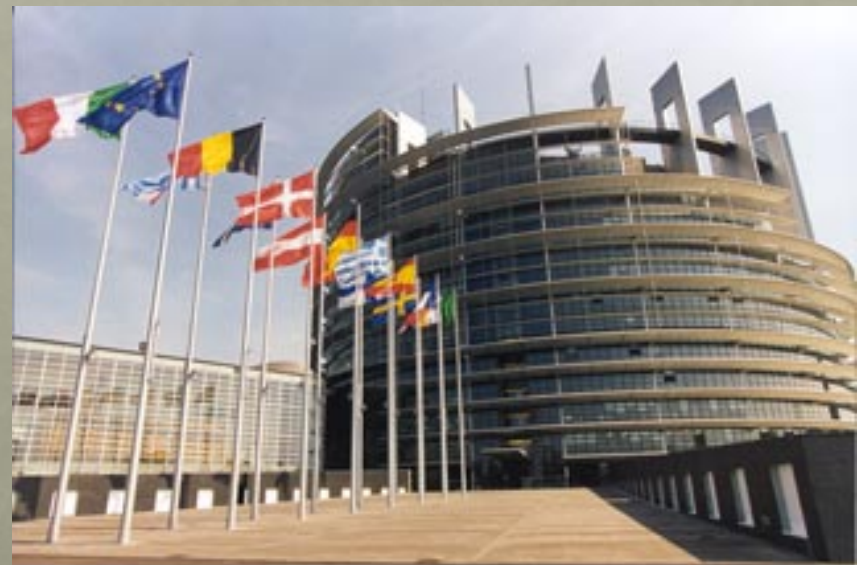
European Parliament: Louise Weiss building, Strasbourg