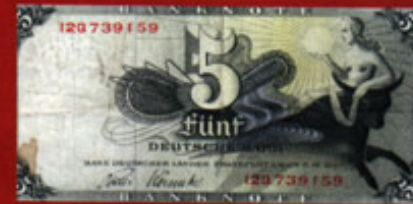
1948 German 5 mark note!