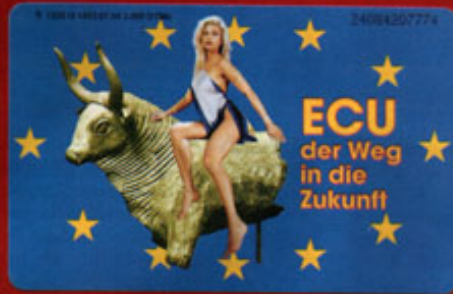
German telephone card!