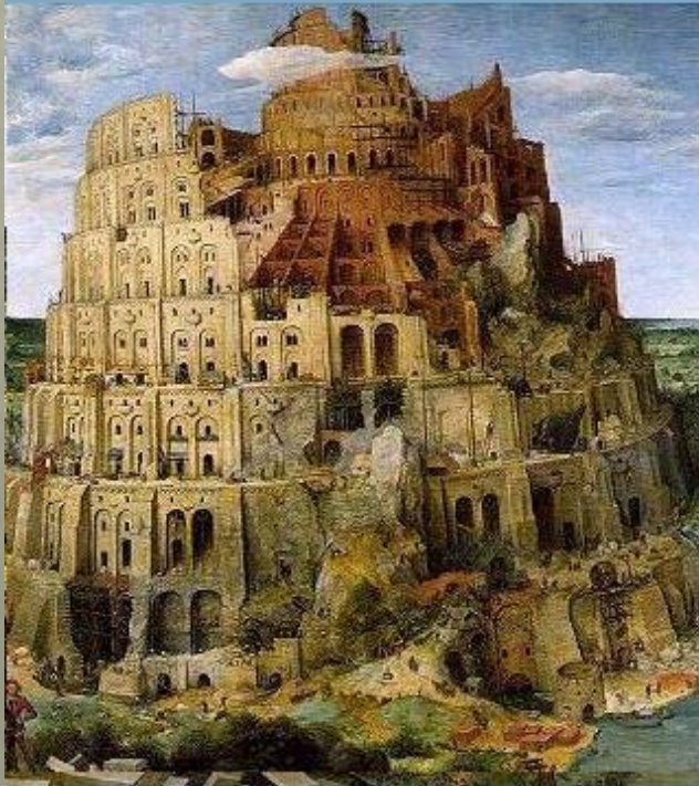
TOWER OF BABEL BY BRUEGHEL